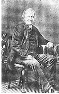
Edward Mote (1797-1874)

On Christ, the solid Rock, I stand; All other ground is sinking sand, All other ground is sinking sand."